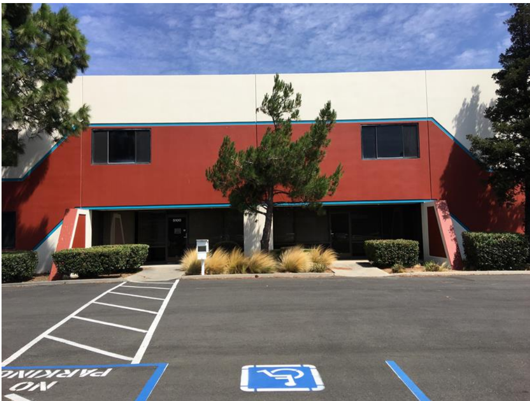
Entrance of the building