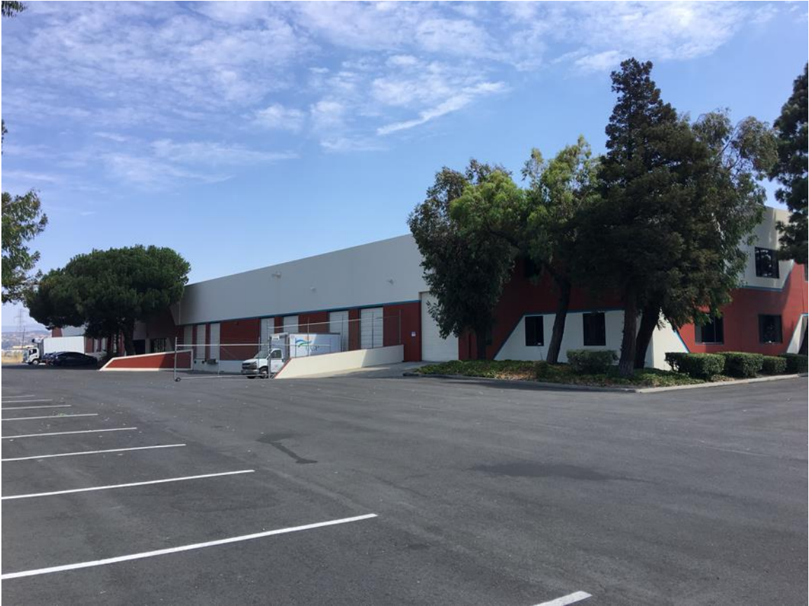
Side view of the building