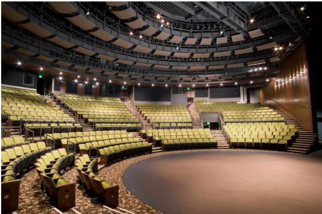
Auditorium Renovations from 2007 Bonds